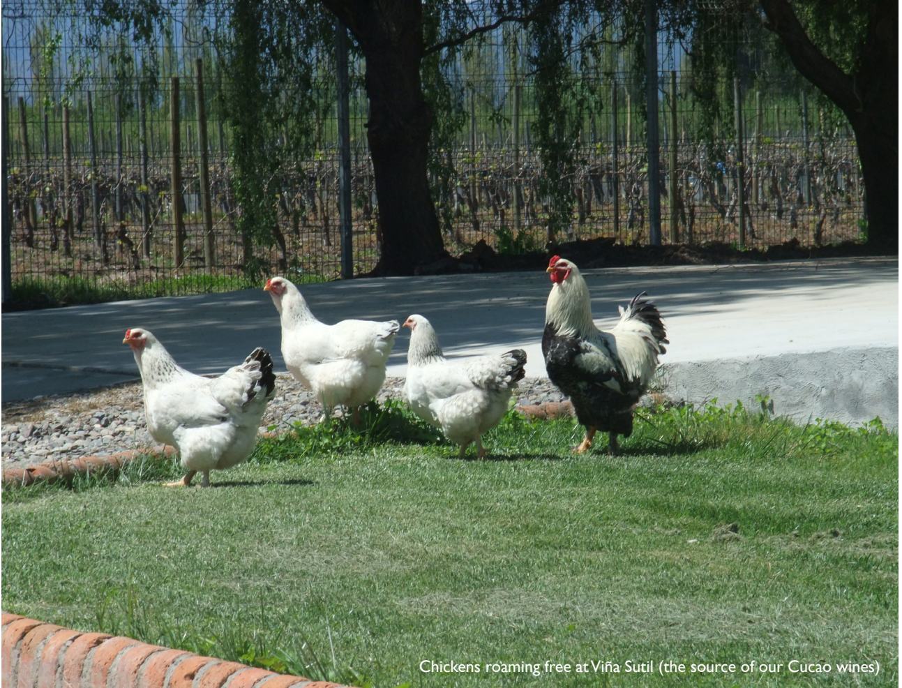
Chickens roaming free at Viña Sutil (the source of our Cucao wines)