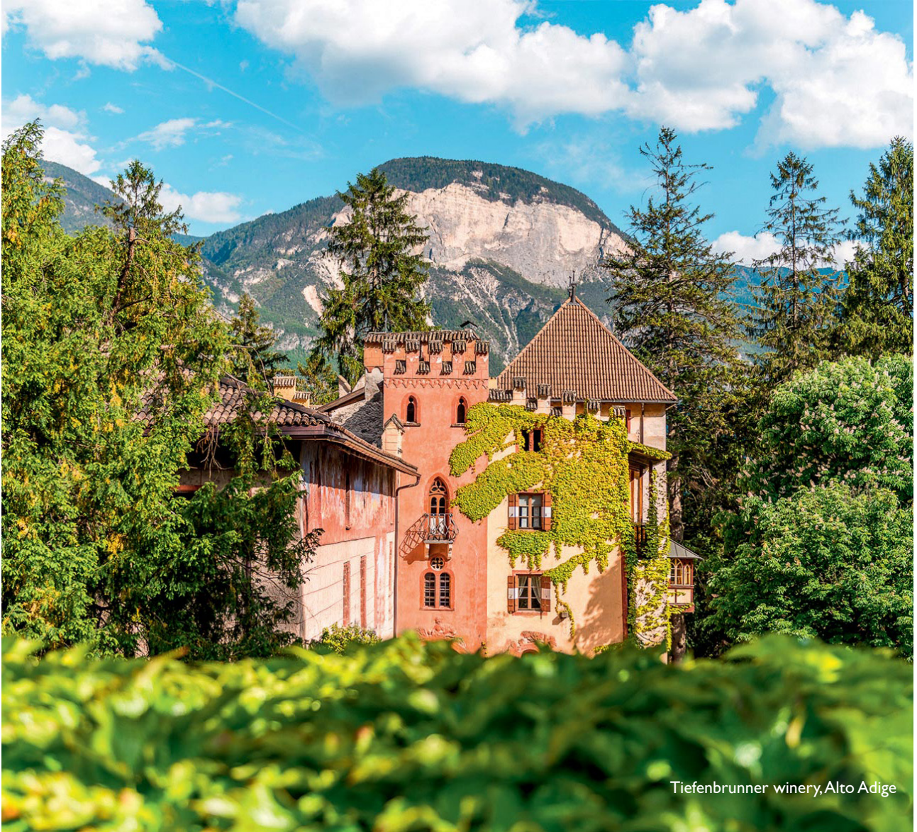
Tiefenbrunner winery, Alto Adige