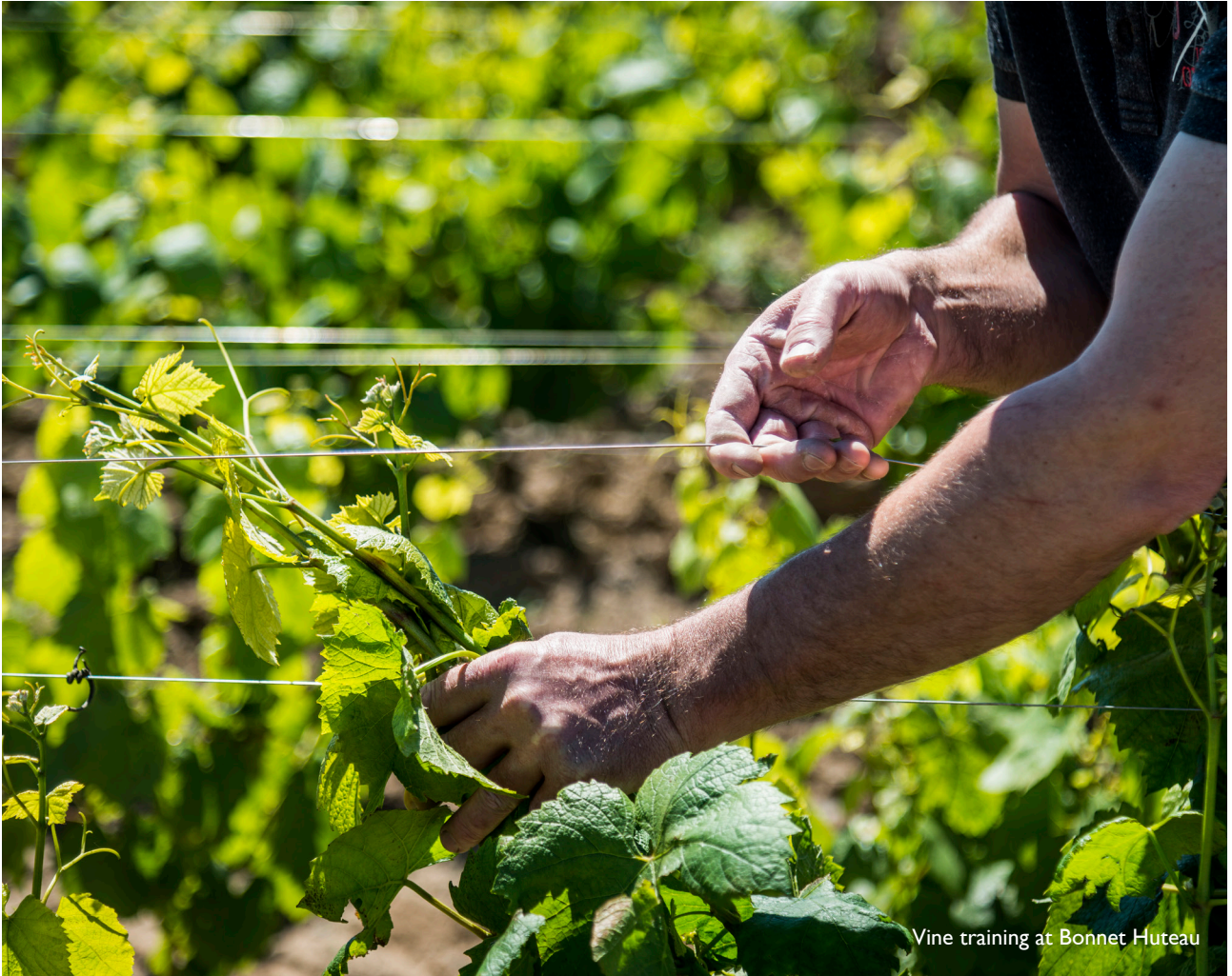
Vine training at Bonnet Huteau