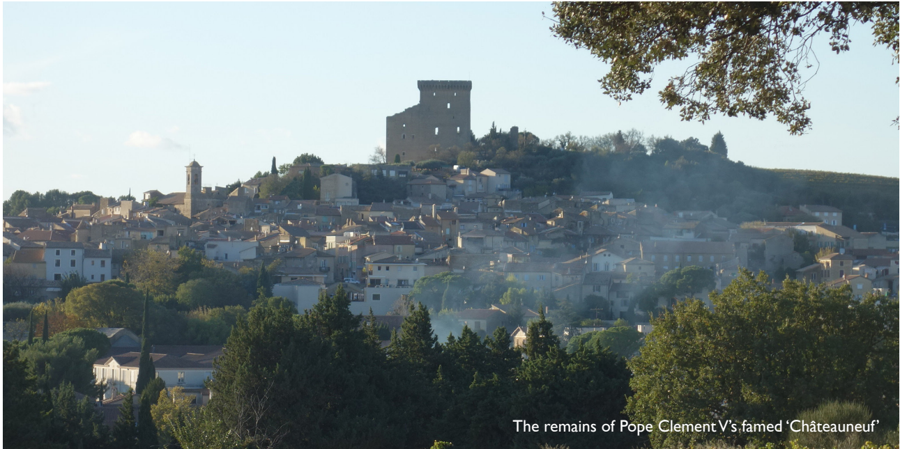
The remains of Pope Clement V's famed 'Châteauneuf'