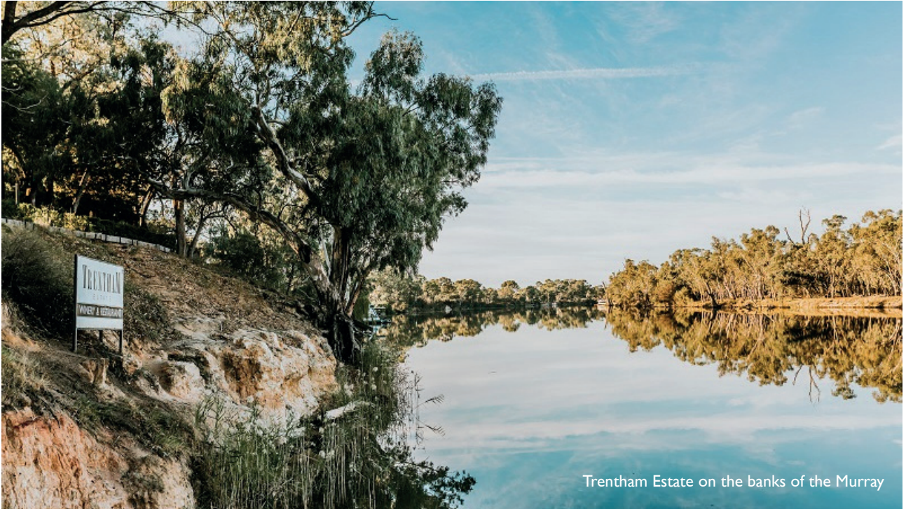
Trentham Estate on the banks of the Murray