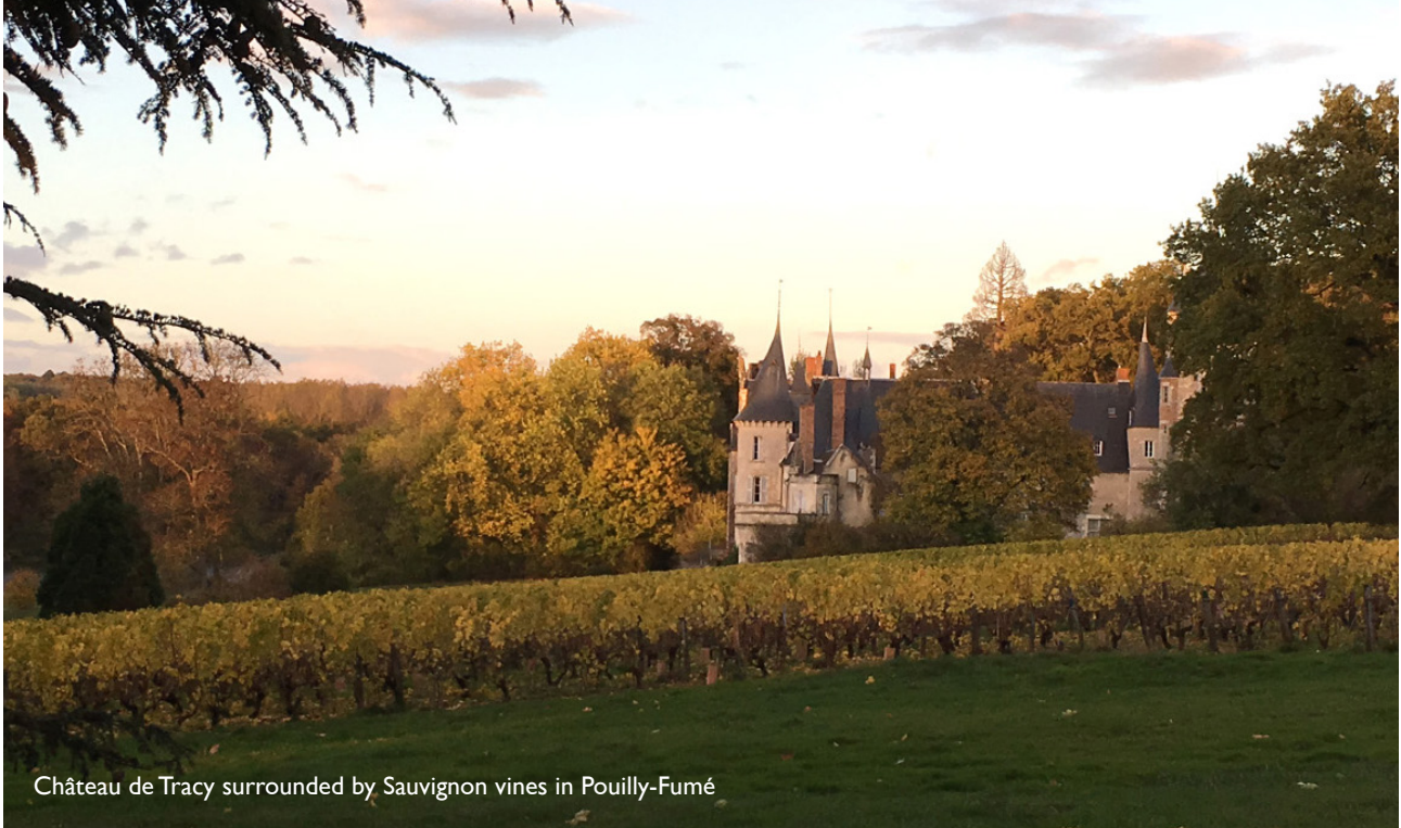
Château de Tracy surrounded by Sauvignon vines in Pouilly-Fumé