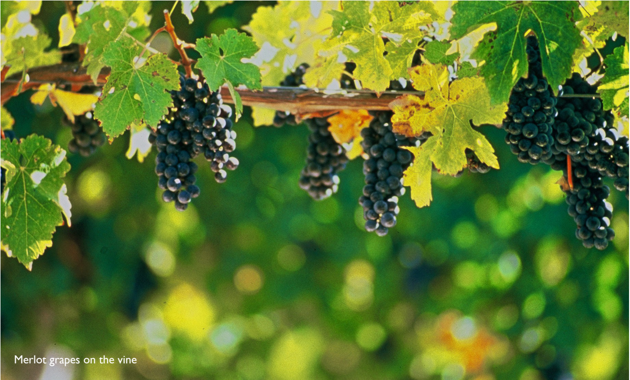
Merlot grapes on the vine