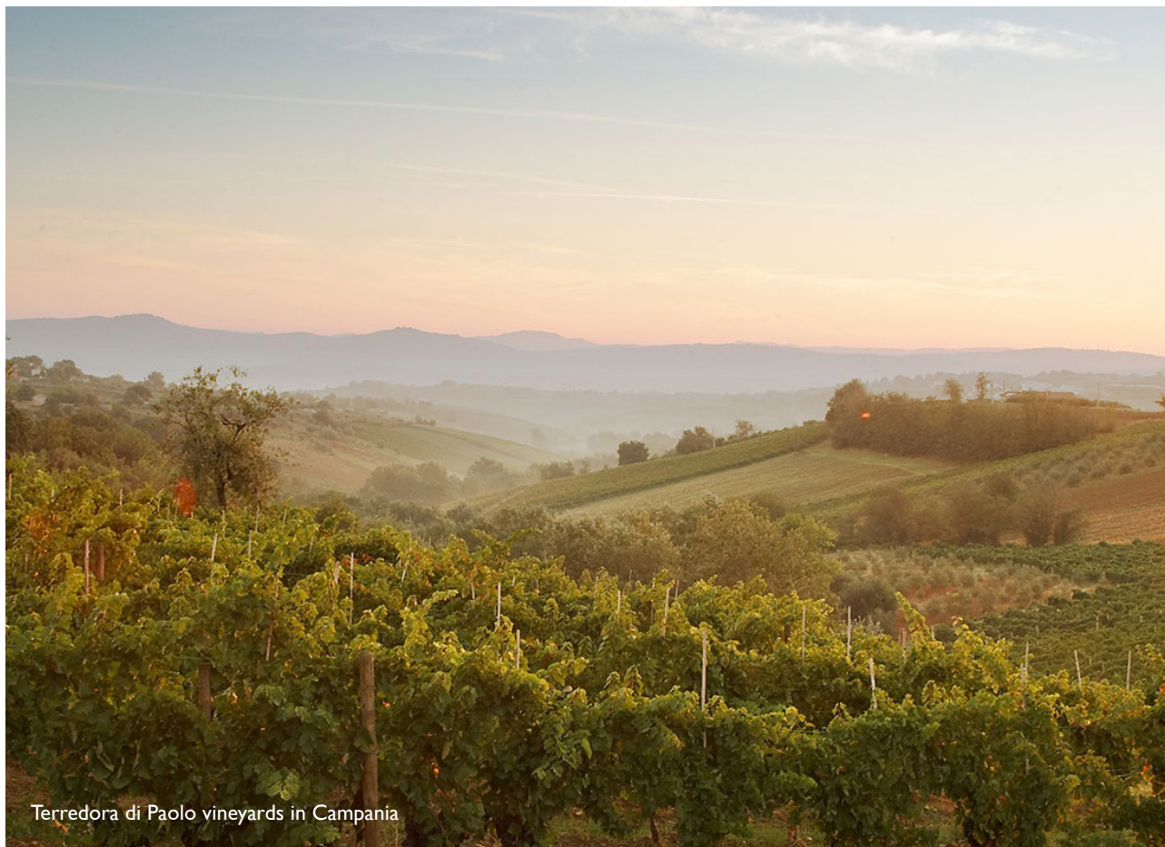
Terredora di Paolo vineyards in Campania