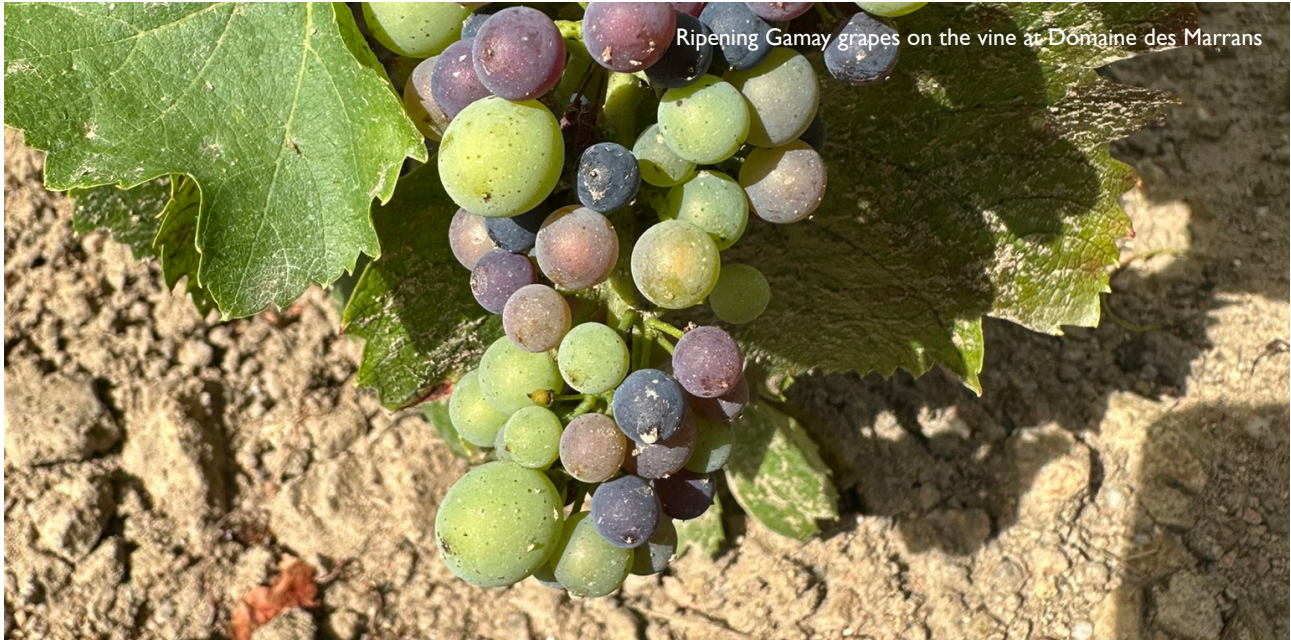
Ripening Gamay grapes on the vine at Domaine des Marrans