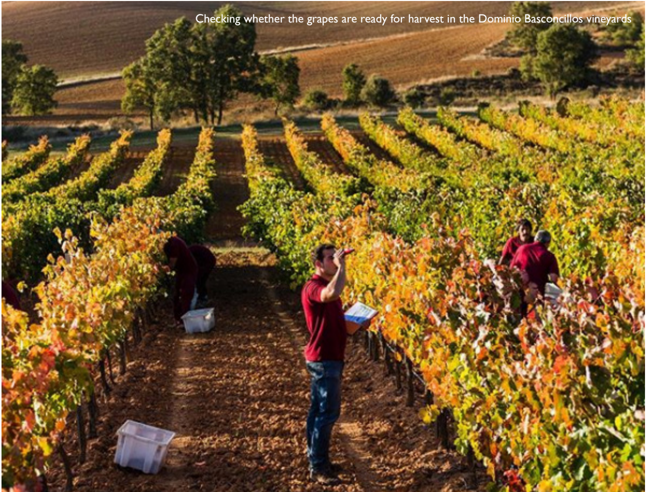
Checking whether the grapes are ready for harvest in the Dominio Basconillos vineyards