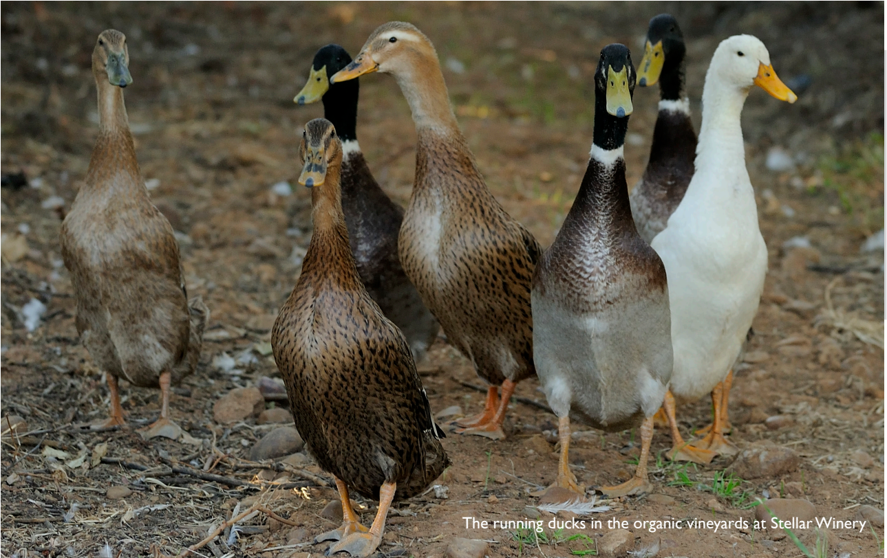
The running ducks in the organic vineyards at Stellar Winery